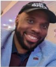
Hon. Dion Powell State Committeeman District 79